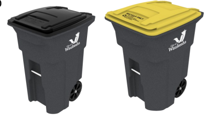
Renderings of new city owned carts. Recycle carts will have yellow lids.

The current (old) carts are the property of Waste Management, and they will be retrieving them once their hauling contract ends. In turn, the city is purchasing new carts which will be delivered to properties. The new carts will be property of the city of Waukesha and will stay at the households for any new contract in the future.