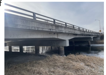
Sunset Dr. bridge

To view all projects, visit www.waukesha-wi.gov/currentprojects