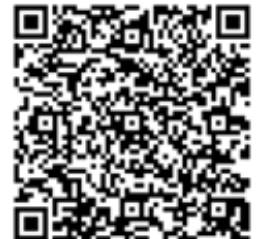
QR Code to Water Softener Rebate webpage.